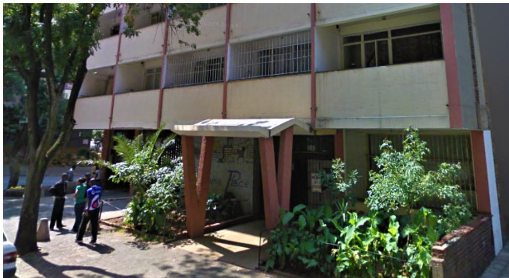
Web Ref AA-862460

Unit 6 & 8 Rotherfield Trust 23 Rotherfield Road Plumstead 7800