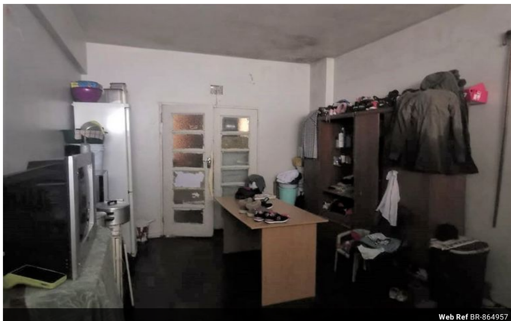
Web Ref BR-864957

Unit 6 & 8 Rotherfield Trust 23 Rotherfield Road Plumstead 7800