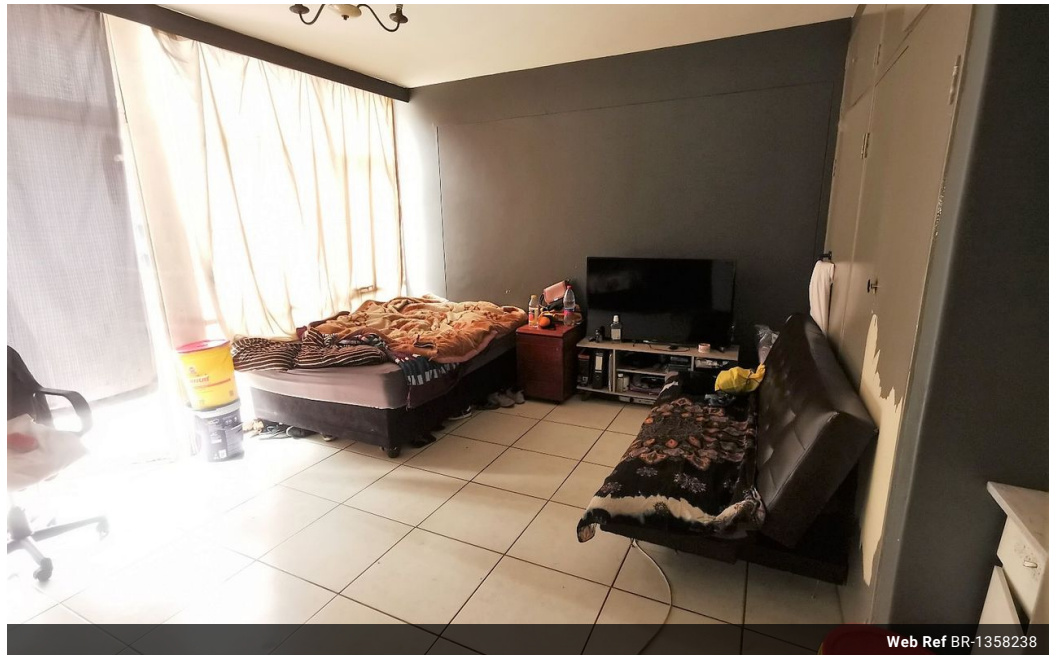
Web Ref BR-1358238

Unit 6 & 8 Rotherfield Trust 23 Rotherfield Road Plumstead 7800