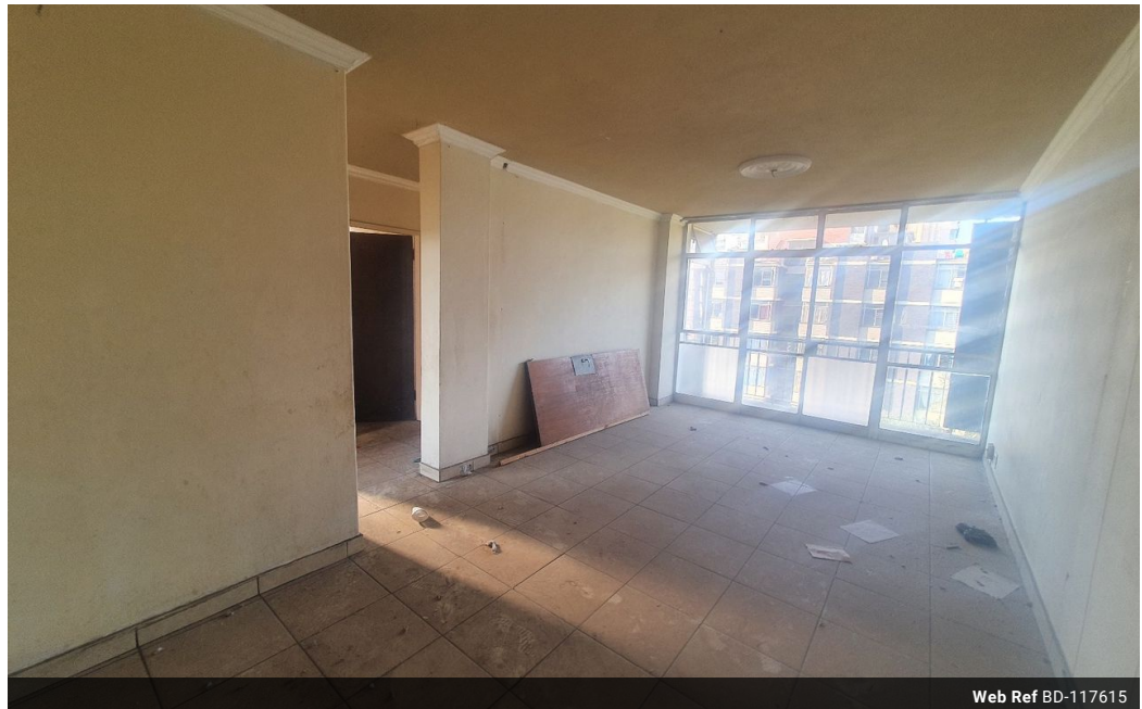
Web Ref BD-117615

Unit 6 & 8 Rotherfield Trust 23 Rotherfield Road Plumstead 7800