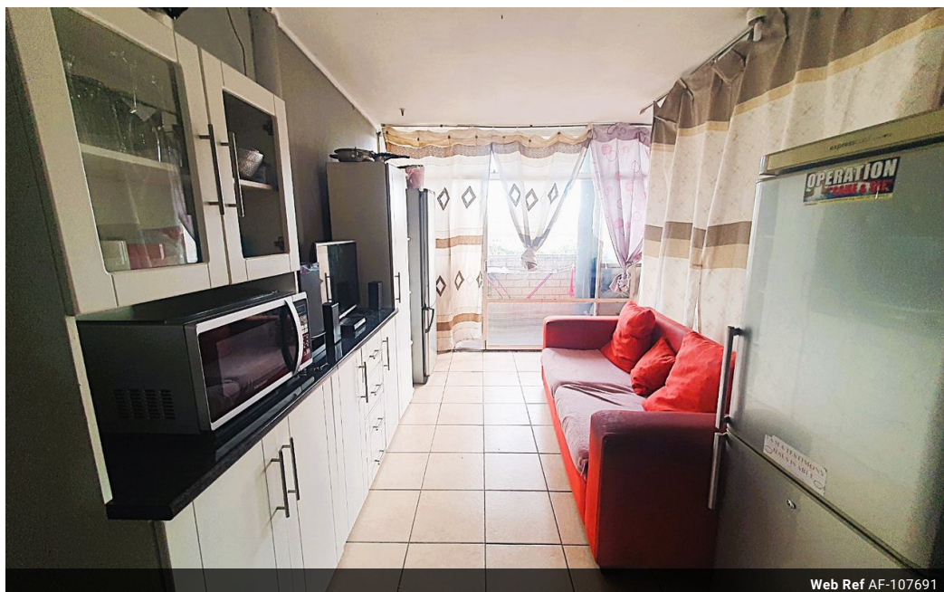
Web Ref AF-107691

Unit 6 & 8 Rotherfield Trust 23 Rotherfield Road Plumstead 7800